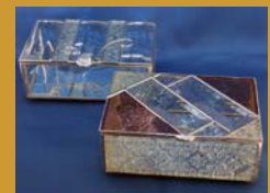
Permit #5745 Expressions in Glass