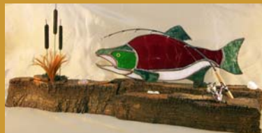
Permit #5820 Bear Klaw Kreation