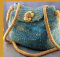
Permit #6037 Jeanne's Fiber Arts