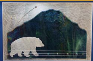
Permit #6013 Alaskan Wish