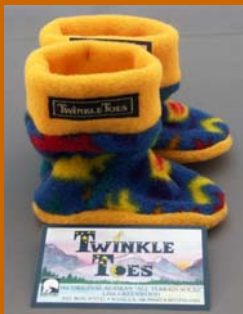
Permit #4003 Twinkle Toes