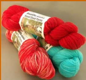
Permit #6064 Fiber N Ice