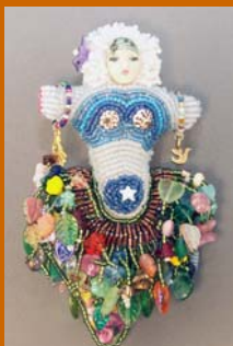
Permit #4580 Designs in Transition

Made In Alaska's 2009 Workshops are now scheduled for the first quarter of the year in eleven cities. This year's dual themes will again be "Marketing to Alaska" and "How To Photograph Products" for the web and your printer.